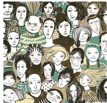
Cover Art: Olga Bolotova, aka HelgaLin Licensed by Shutterstock

When the students and I wrote this song together, we used percussion instruments that happened to be in the school music room, like jingle bells, slide whistles, claves, castanets, and sandblocks. These diverse instruments became our musical representation of our own individuality. When YOU sing this song, feel free to use any instruments you have around — or maybe even build your own!