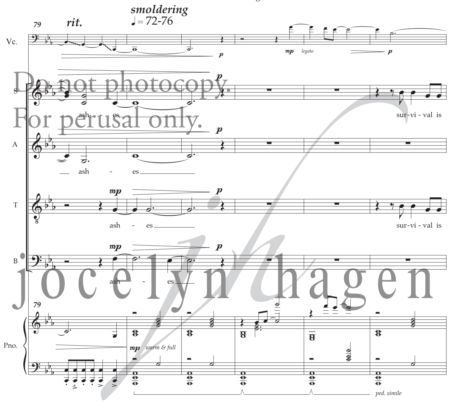
Do not photocopy. For perusal only.