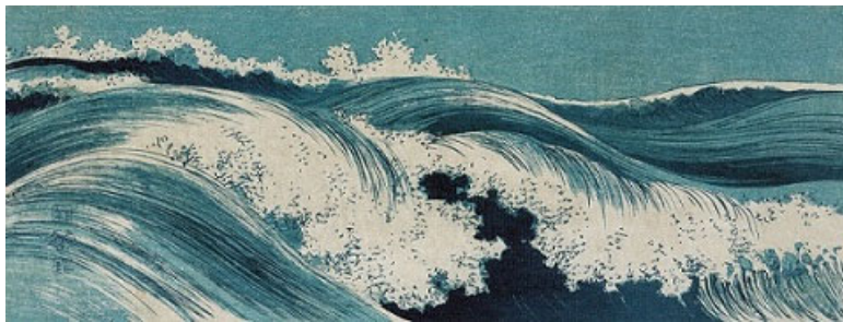
Cover Image: “Waves” Woodcut by Kōnen Uehara (ca. 1910)

Several different English translations of this prayer exist. The translator of this version is unknown.