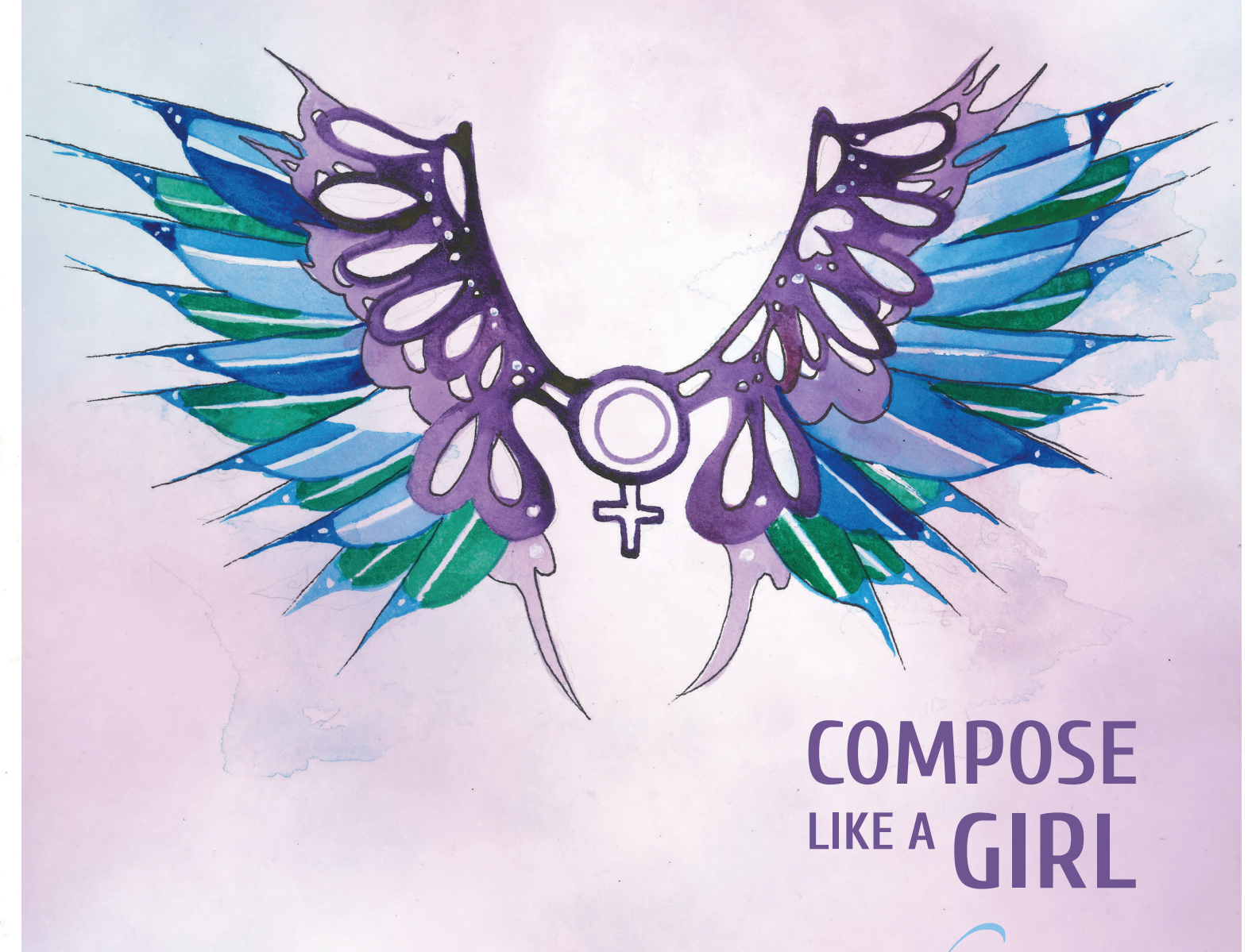
Illustration: KT Thompson